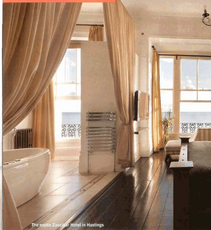
The exotic Zanzibar Hotel in Hastings