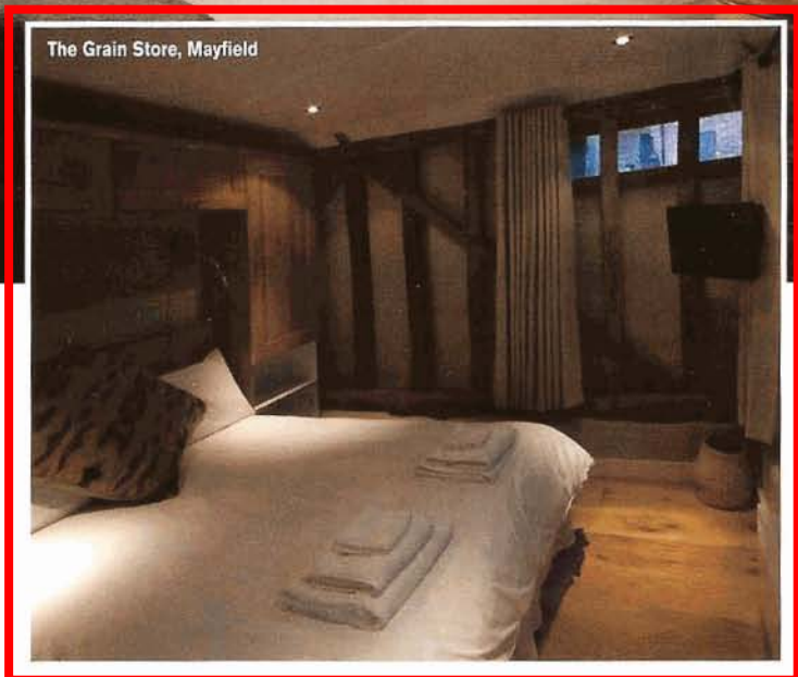
The Grain Store, Mayfield

▶ all guests, as can all of the 12 acres of beautiful grounds. Mountain bikes are available, and the barn provides quick access to lovely Mayfield, perfect for a pub lunch or a spot of shopping.