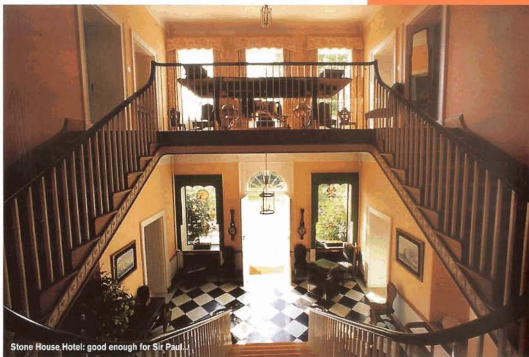
Stone House Hotel: good enough for Sir Paul...

Chapel Down vineyards in Tenterden. The Farmhouse was recently refurbished by the National Trust, who have preserved the Victorian quirkiness of the house, but simultaneously modernised it to provide luxurious accommodation – all within the historic grounds of Sissinghurst Castle. The Farmhouse has seven double bedrooms, all with en-suite bathrooms and spectacular views across the Sissinghurst Estate.