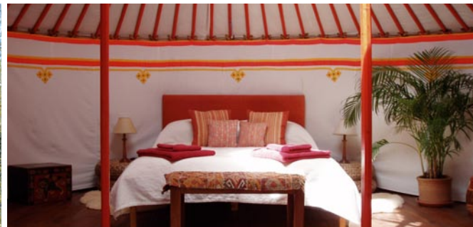
Moroccan mountain lodge

Fancy sleeping in an Afghani or Mongolian yurt, but can't be arsed with the long-haul flight? Then get yourself to Andalucia, Spain, where the Hoopoe Yurt Hotel offers