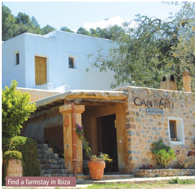
Find a farmstay in Ibiza