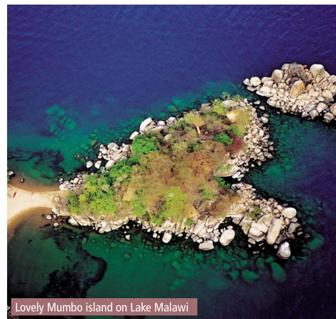
Lovely Mumbo island on Lake Malawi

Kasbah du Toubkal is a mountain retreat perched in the Atlases, within the tiny village of Achein, giving a taste of remote Moroccan life. Local labour and