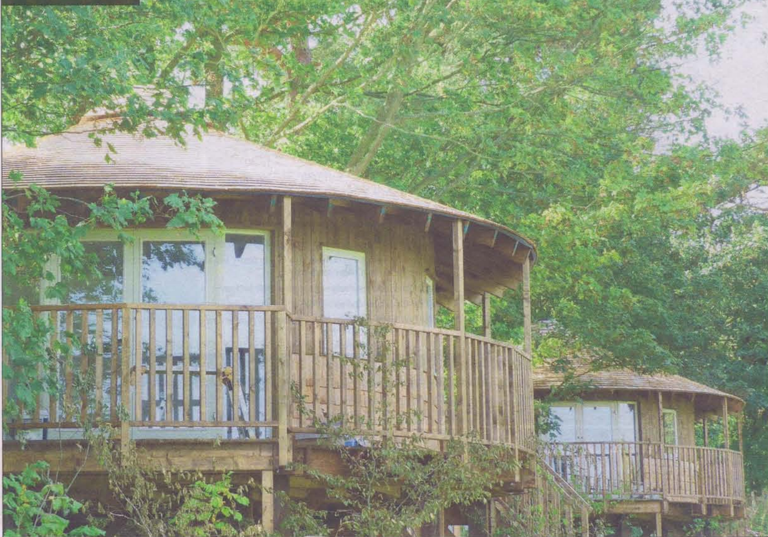
Green dream: Fair Oak Farm eco-lodge treehouses come with mod cons