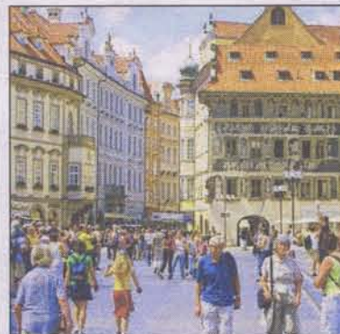
Czech first: some dodgy foreign exchange outlets operate in the capital