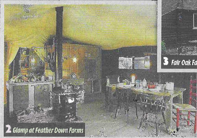
2 Glamp at Feather Down Farms