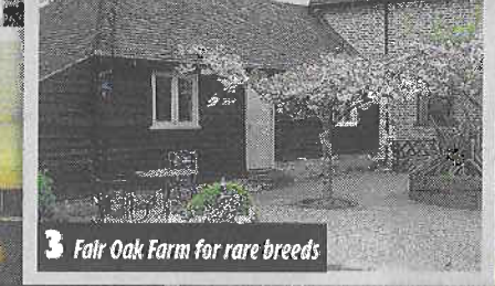
3 Fair Oak Farm for rare breeds

THE DEAL: Four nights in Ewe Cottage, arriving March 29 costs £494; seven