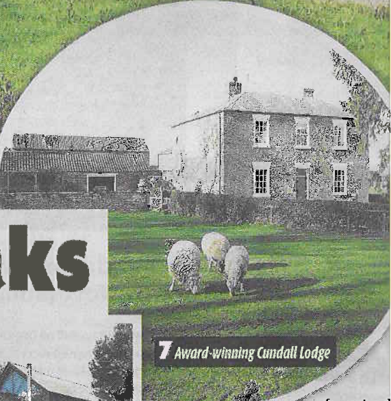
7 Award-winning Cundall Lodge

farmstead Hatts Farm on the Dorset/Wiltshire border. The farm is a designated Area of Outstanding Natural Beauty near Shaftesbury. Stay Dairyman's Cottage, a converted traditional barn, sleeping four.