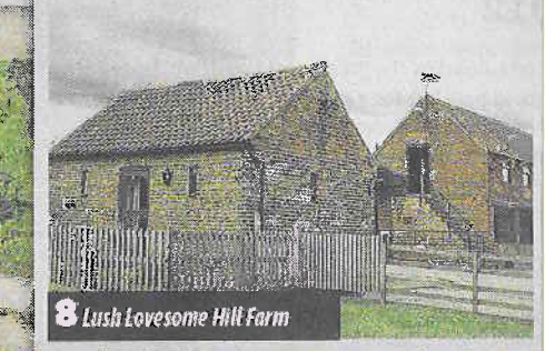
8 Lush Lovesome Hill Farm