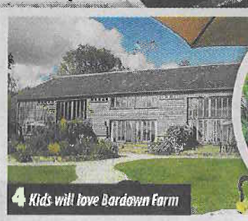
4 Kids will love Bardown Farm