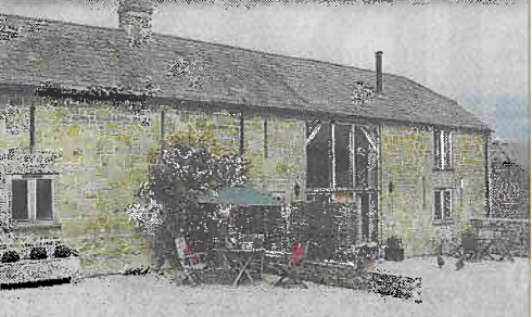
9 Hatts Farm for outstanding beauty