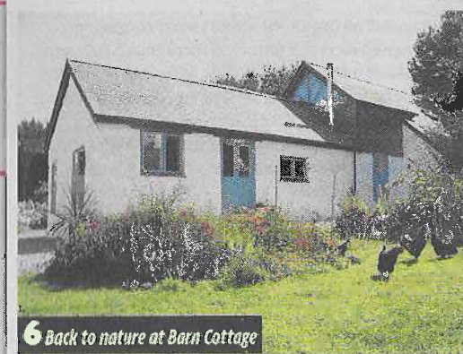
6 Back to nature at Barn Cottage

THE DEAL: Double rooms from £80 per night B&B. Go to www.sundaymirror.co.uk/travel/top10