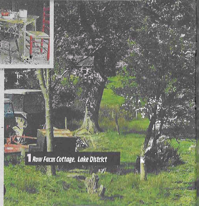
1 Row Farm Cottage, Lake District