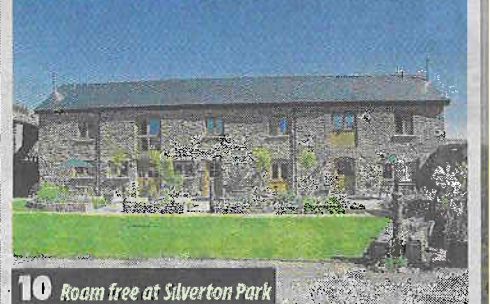
10 Room free at Silverton Park

THE DEAL: Two nights' full-board in an ensuite room in the farmhouse or granary conversion costs £100 per adult, £50 per child sharing (single occupancy £20). Go to www.sundaymirror.co.uk/travel/top10